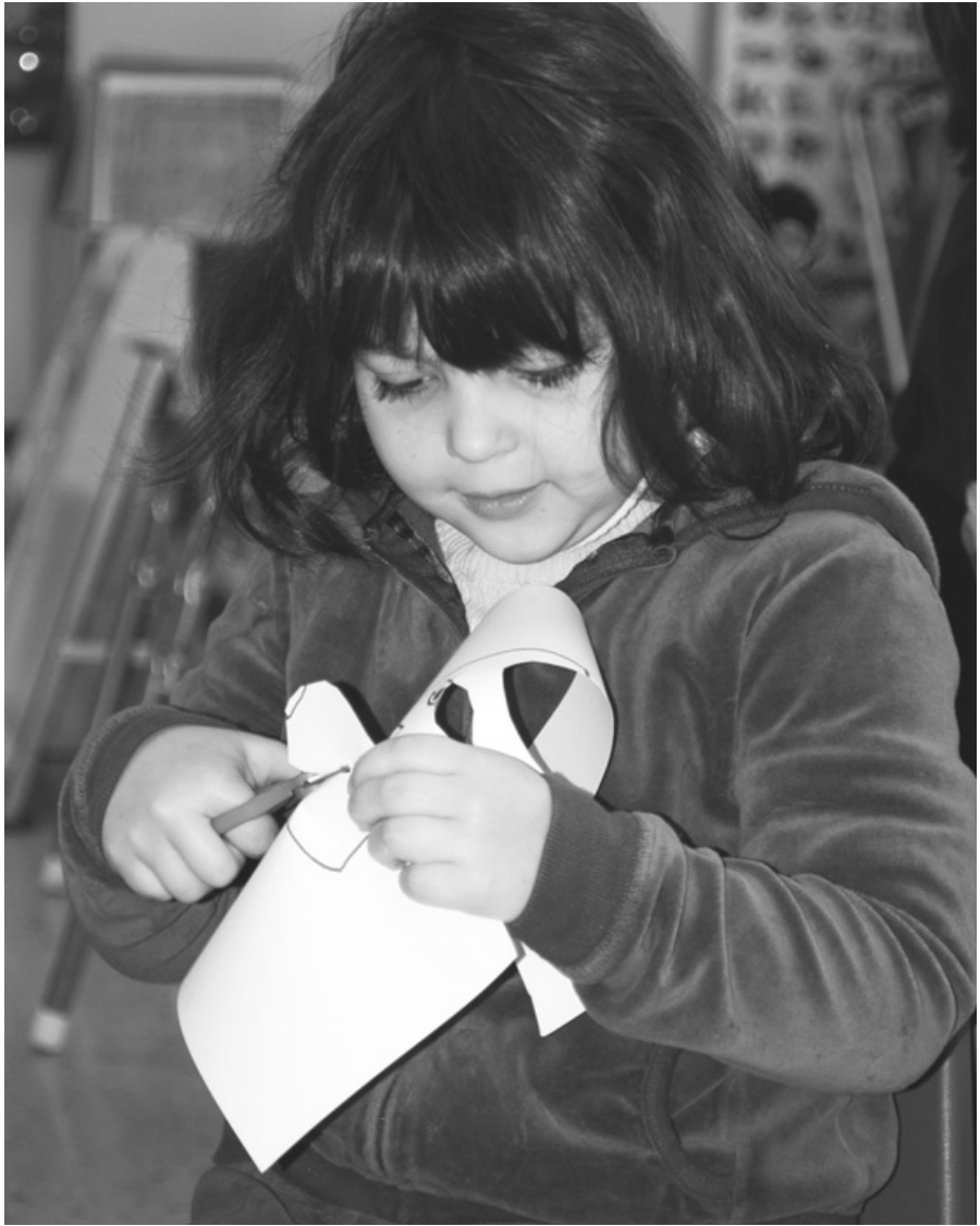
Subjects & Predicates

Effectively individualizing instruction is a cycle that involves knowing individual children, implementing effective instructional strategies, and determining whether or not the choices made resulted in child learning.